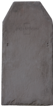
Welsh Heather / Purple