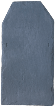
Welsh Blue / Grey