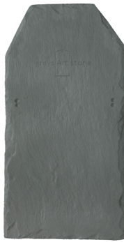
Westmorland Green Single Size Slate