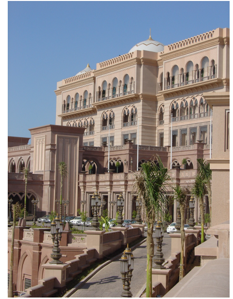
Emirates Palace, UAE 120,000m<sup>2</sup> Standard sand blasted GRC