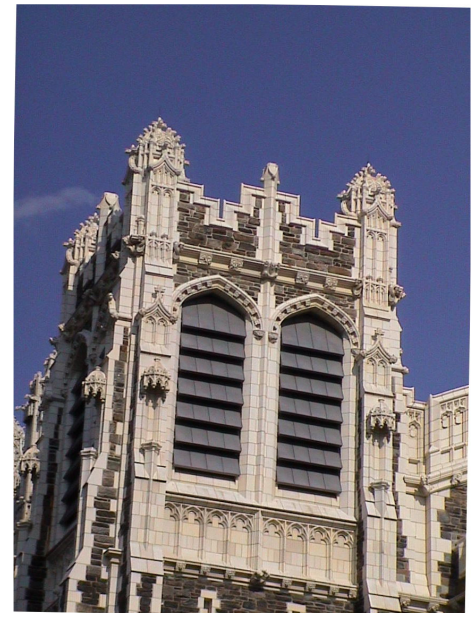
Shepard Hall, City College New York (1990's) 75,000 GRC elements with metakaolin and polymer addition

International Glassfibre Reinforced Concrete Association, The Concrete Society Riverside House, 4 Meadows Business Park, Station Approach, Blackwater, Camberley, Surrey. GU17 9AB Tel: +44(0)1276 607140 Fax: +44(0)1276 607141 Email: <u>info@grca.co.uk</u> Web: <u>www.grca.org.uk</u>