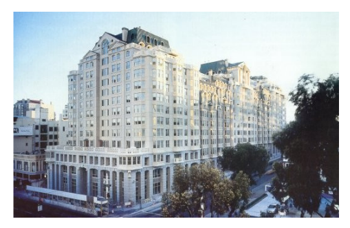
San Francisco Towers, USA 155,000 GRC elements with polymer addition